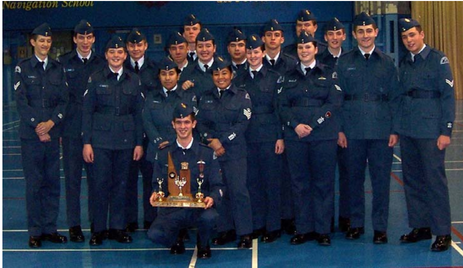
170 RCACS Drill Team winners of the 2003 W/C Cooper Competition