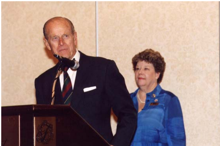
H.R.H. The Prince Philip Addresses the Recipients and Guests

The Duke of Edinburgh's Award Young Canadians Challenge promotes community service, skill development, physical fitness, explorations and expeditions. During the Royal Visit to Winnipeg and Manitoba on October 8, 2002, H.R.H. the Duke of Edinburgh presented Gold and Silver Awards to 74 participants of the program, seven who are past or serving Manitoba Air Cadets. The recipients were: