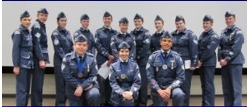
2010 Effective Speaking Competitors

The 2010 Manitoba Effective Speaking Competition was held on Sunday February 21 in Building 135 on 17 Wing Winnipeg.